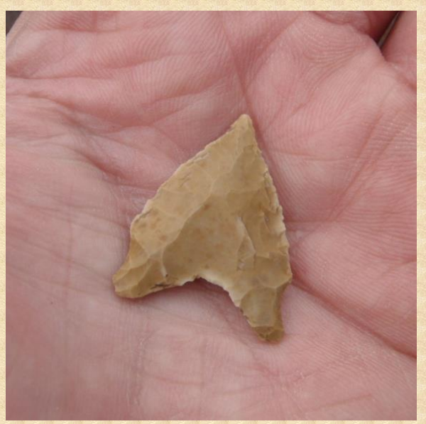
We've now found two San Patrice points during the screening project. These points date to approximately 7500 BC!