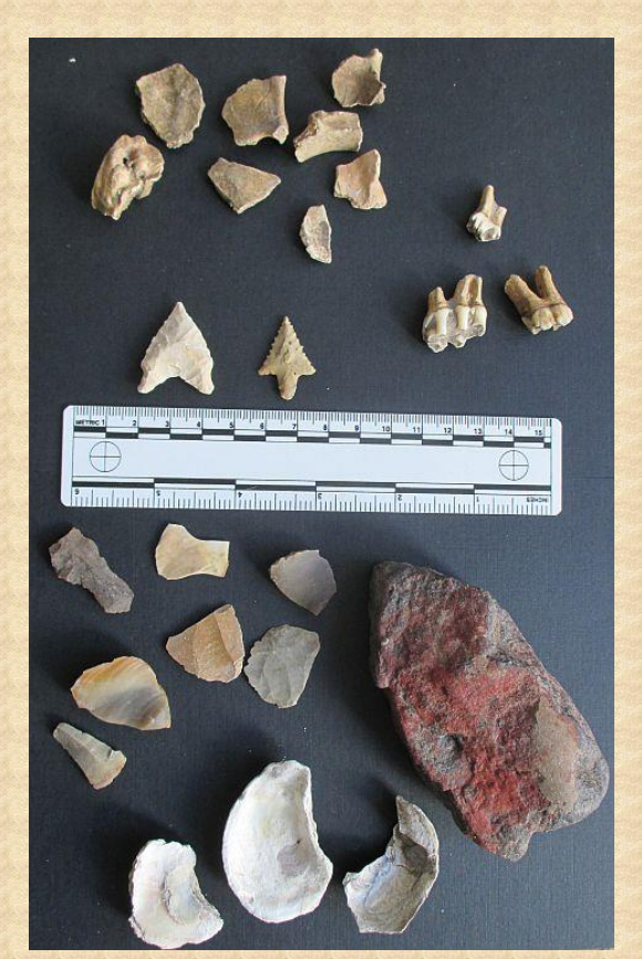
Here are just a few of the artifacts we recovered January 4 - 11 including bone fragments, teeth, lithic flakes, shell and the rock on the right which is likely red paint or ochre.