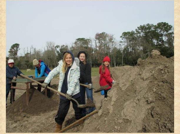
A little cold weather did not bother these students from Rosehill Christian School!